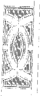
Viewed from Exterior. Scale: 1/4" = 1'

AURORA 252 FLAT TOP, MAHOGANY GRAIN, 3-00 6-08 1-3/4, POLISHED ZINC CAME TRIPLE GLAZED A GLASS, SEQUOIA FINISH, W/PREHUNG, BEV: 1/S, RH, CHROME FLUSHBOLTS, CONCEALED-BEARING 4-1/2 X 4-1/2 SQ. HINGE PREP, HP: 7-3/8, 37-5/16, 67-1/4, BRITE DIP CHROME SWEEP